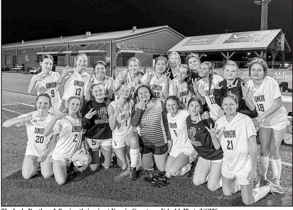
The Lady Panthers following their win at Fannin County on Feb. 14.

Blue Ridge - Union County soccer opened the 2025 season with a pair of narrow wins at Fannin County on Friday, Feb. 14.